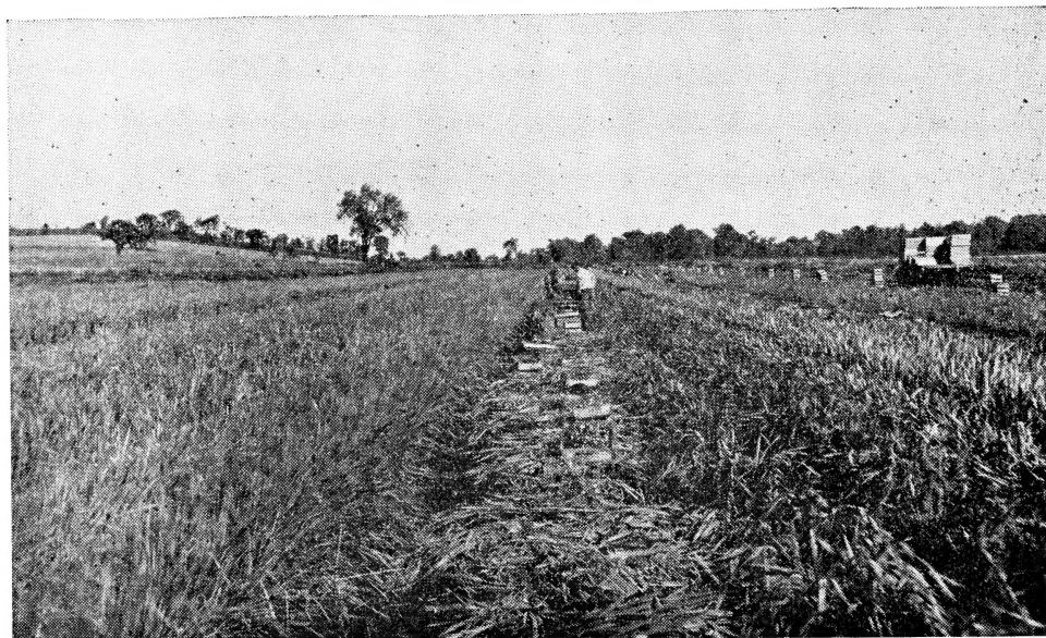
Six-Acre Field of Our Bulblet-Grown Stock in Three-Foot Rows